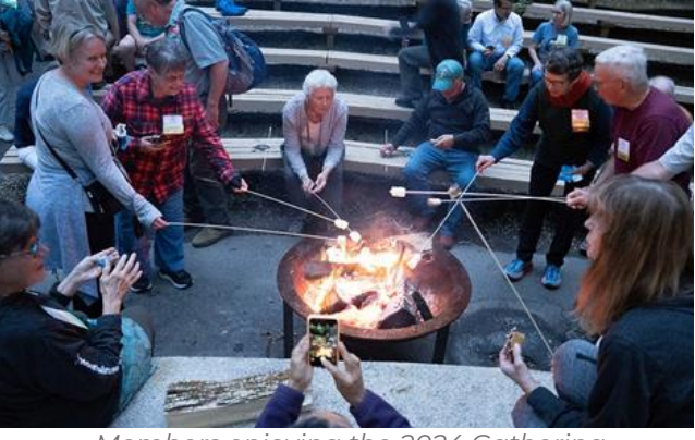
Members enjoying the 2024 Gathering