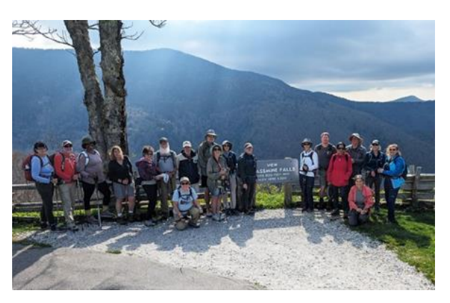
Hikers at the 2024 Gathering

Our members will enjoy time together in two neighboring hotels in Kill Devil Hills, the Comfort Inn on the Ocean and Ramada Plaza by Wyndham. Attendees will have several days to explore the unique beauty and adventure of the Outer Banks. From the historic lighthouses to the wildlife at Pea Island, we will explore it all!