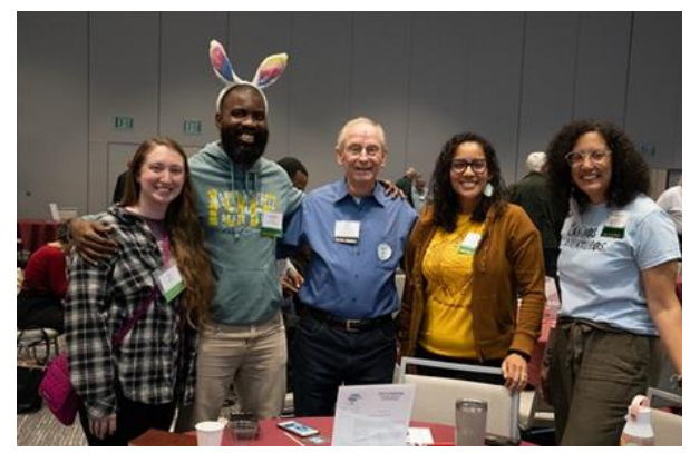
Gathering of Friends 2023 at NC Central University

Our members will enjoy time together in two neighboring hotels in Kill Devil Hills, the Comfort Inn on the Ocean and Ramada Plaza by Wyndham. Attendees will have several days to explore the unique beauty and adventure of the Outer Banks. From the historic lighthouses to the wildlife at Pea Island, we will explore it all!