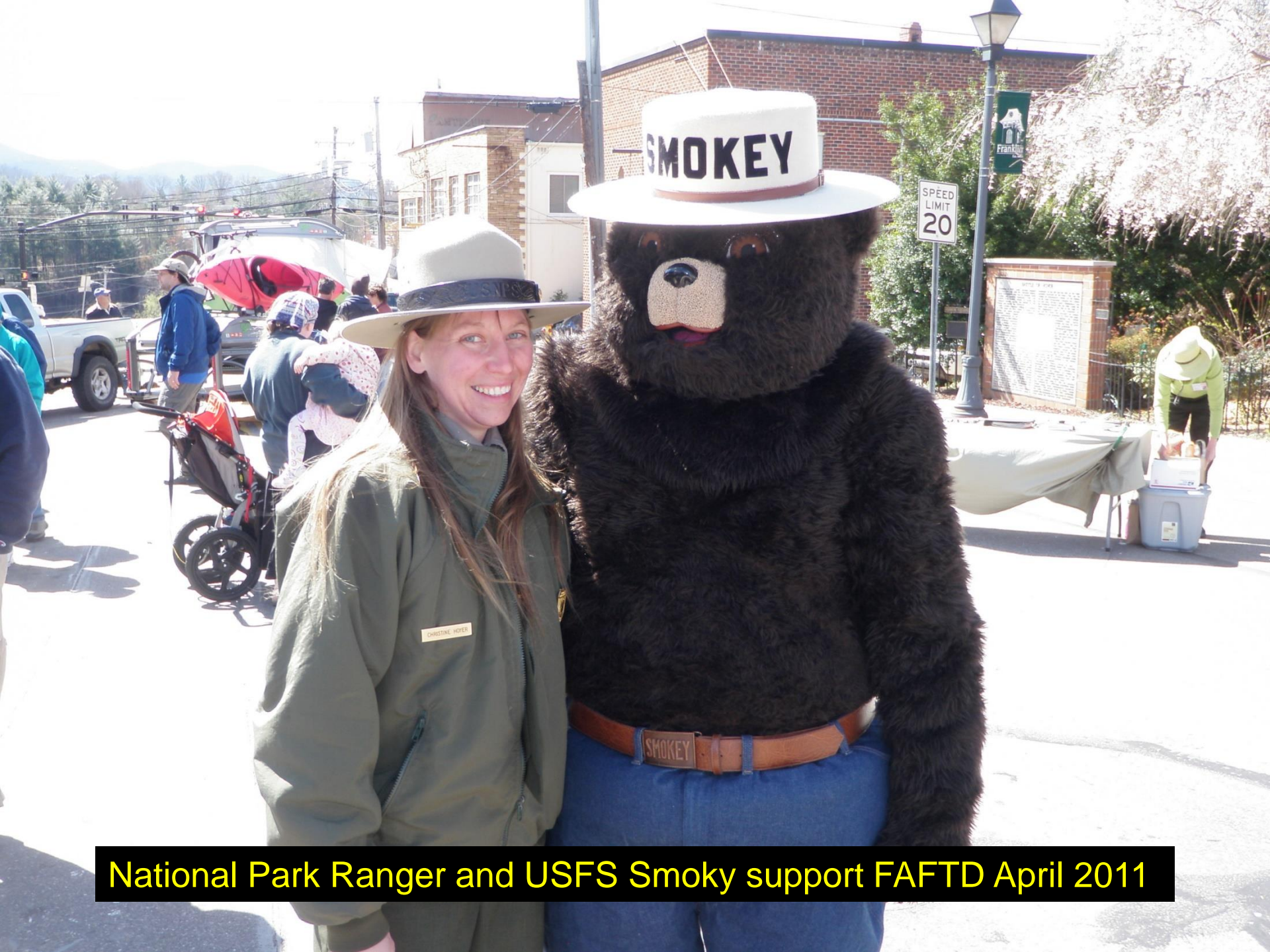
National Park Ranger and USFS Smokey support FAFTD April 2011