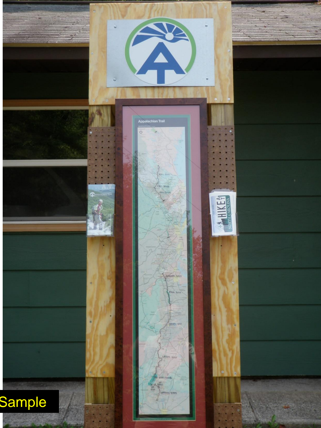
Business Display Sample