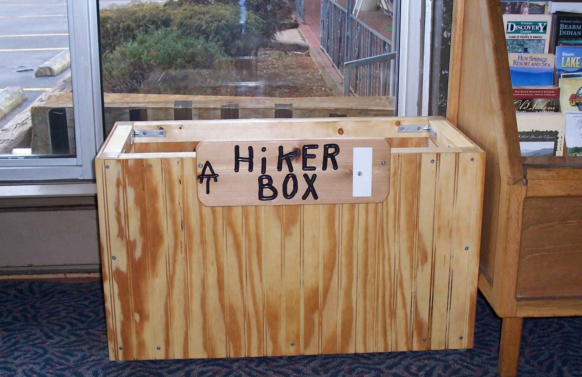
NHC constructed "Hiker Box" for local Franklin motels Spring 2009