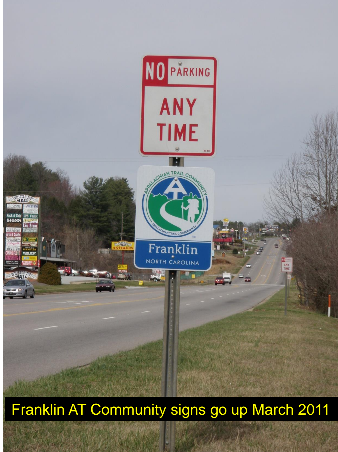
Franklin AT Community signs go up March 2011