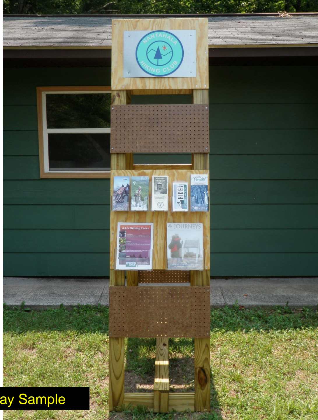
Business Display Sample