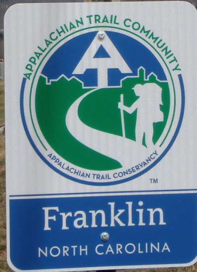
Franklin AT Community signs go up March 2011