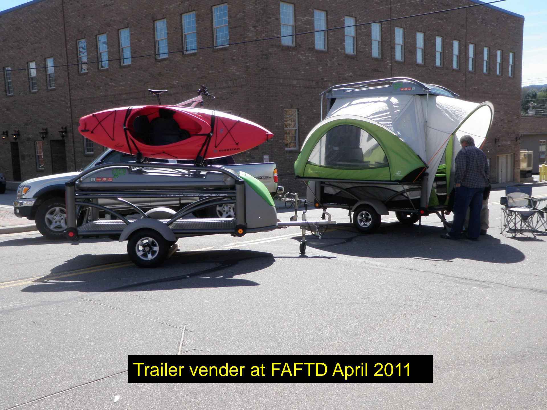
Trailer vender at FAFTD April 2011