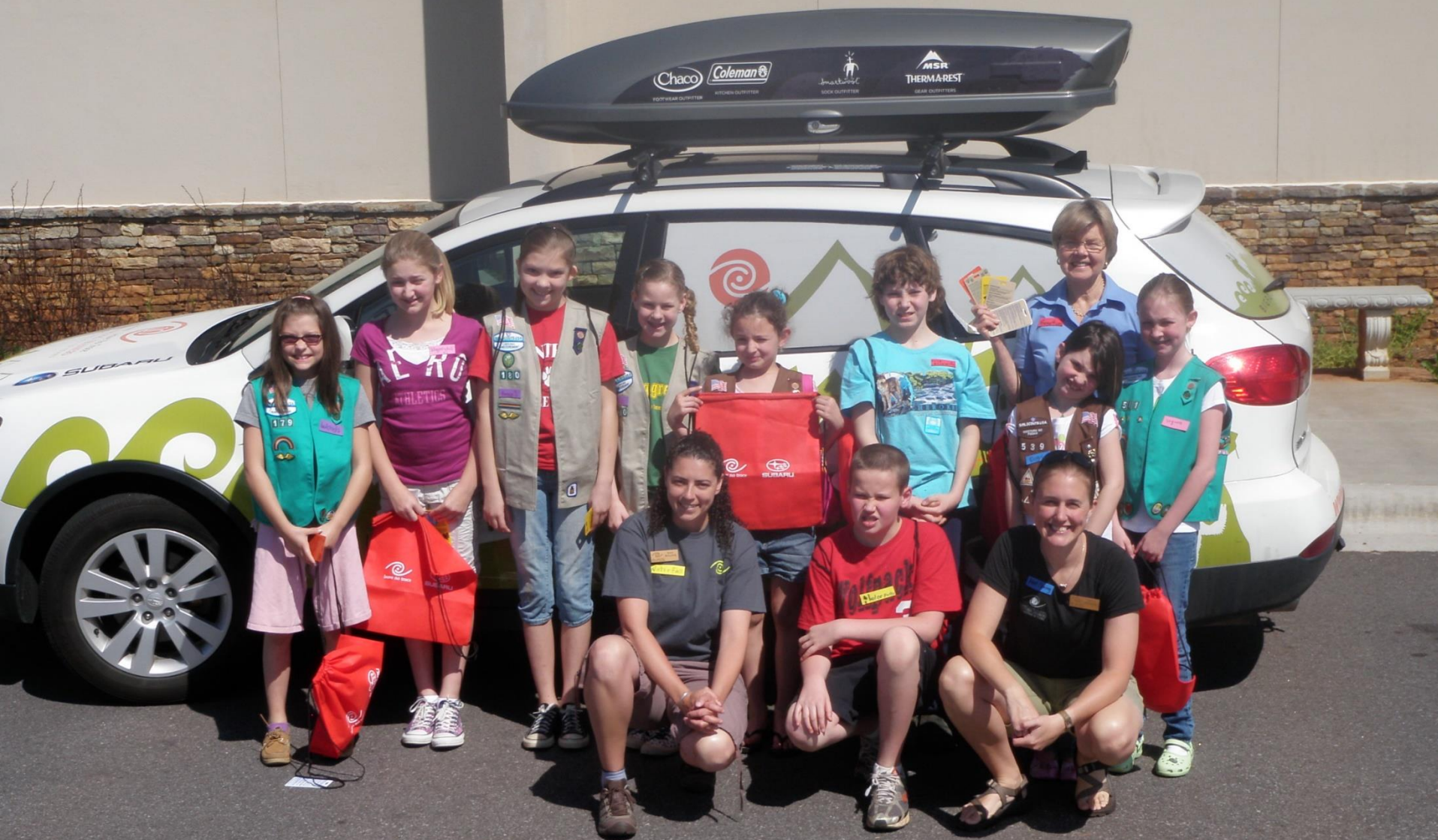
LNT Traveling Trainer Team Spring 2010