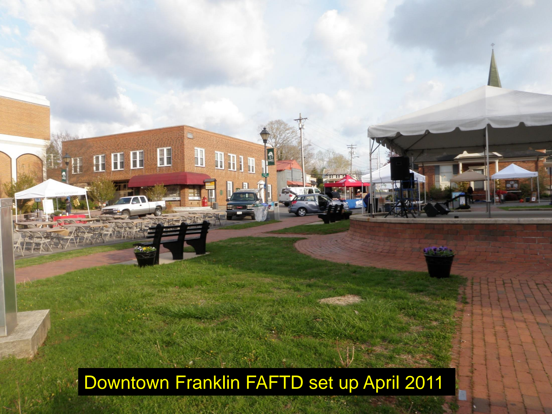
Downtown Franklin FAFTD set up April 2011