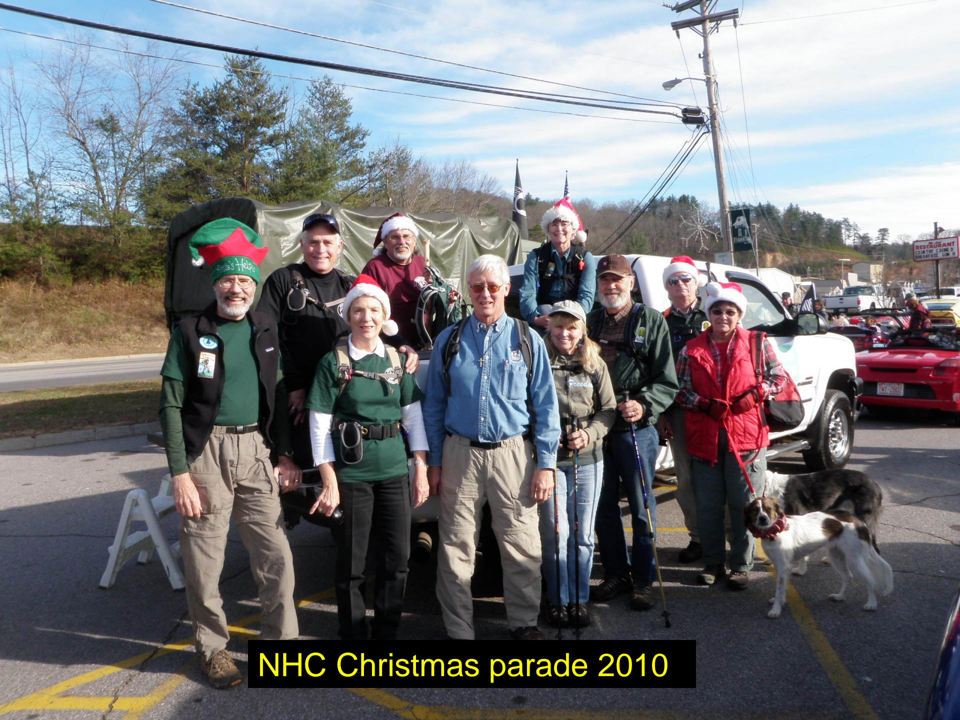
NHC Christmas parade 2010