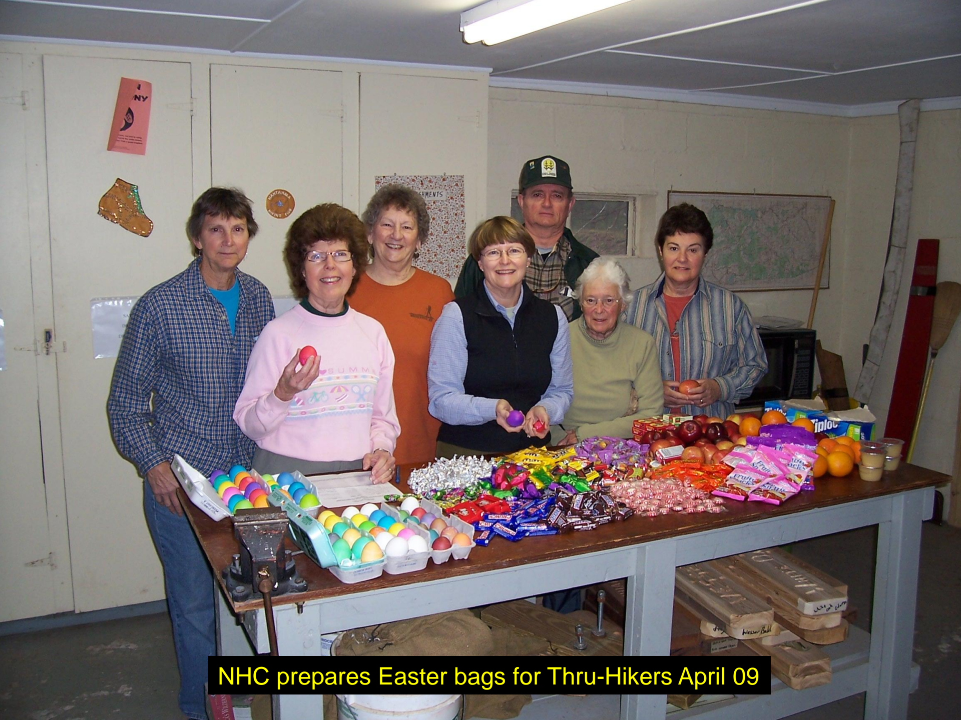
NHC prepares Easter bags for Thru-Hikers April 09