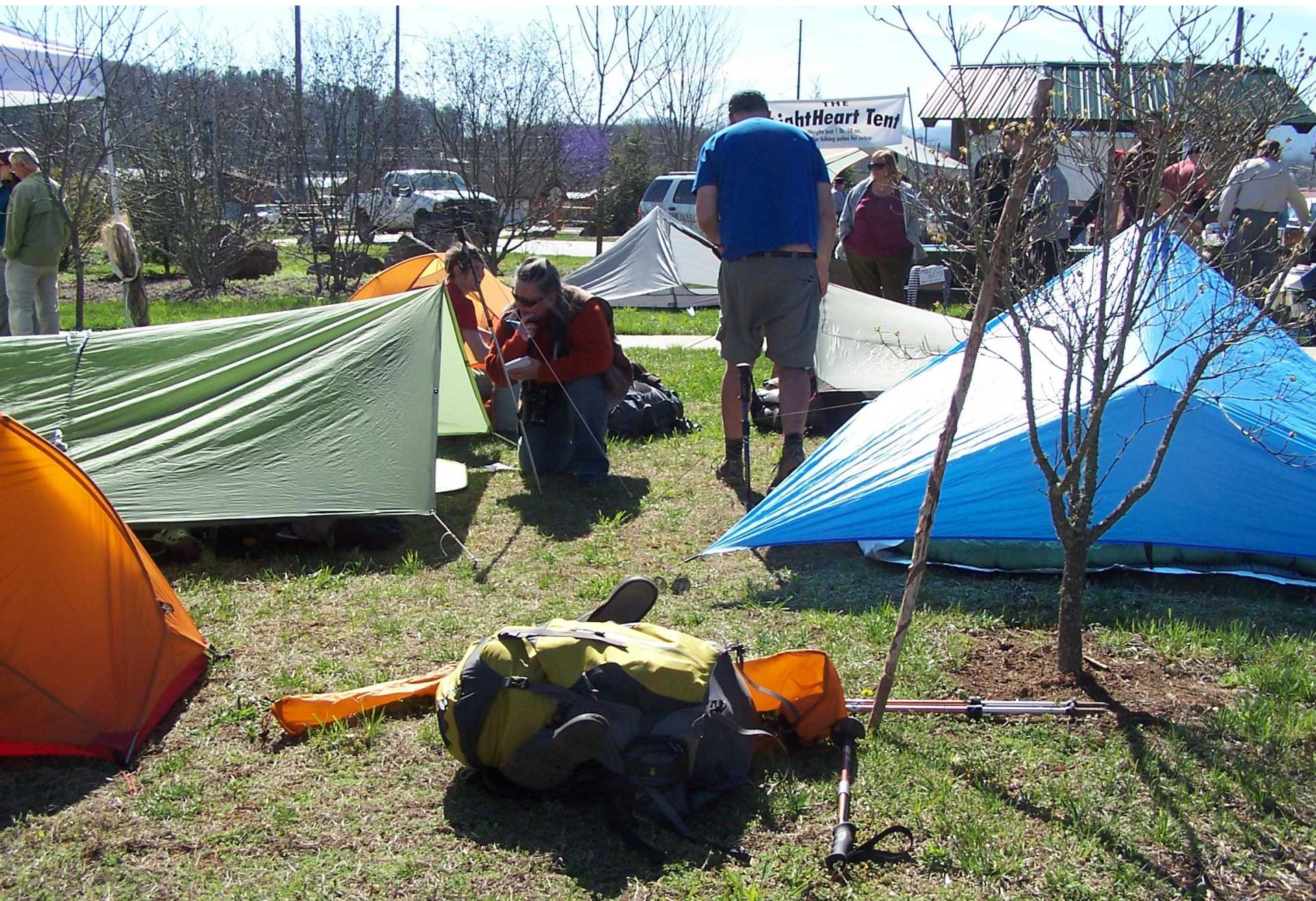
Tent Vender Display Trail Days April 09