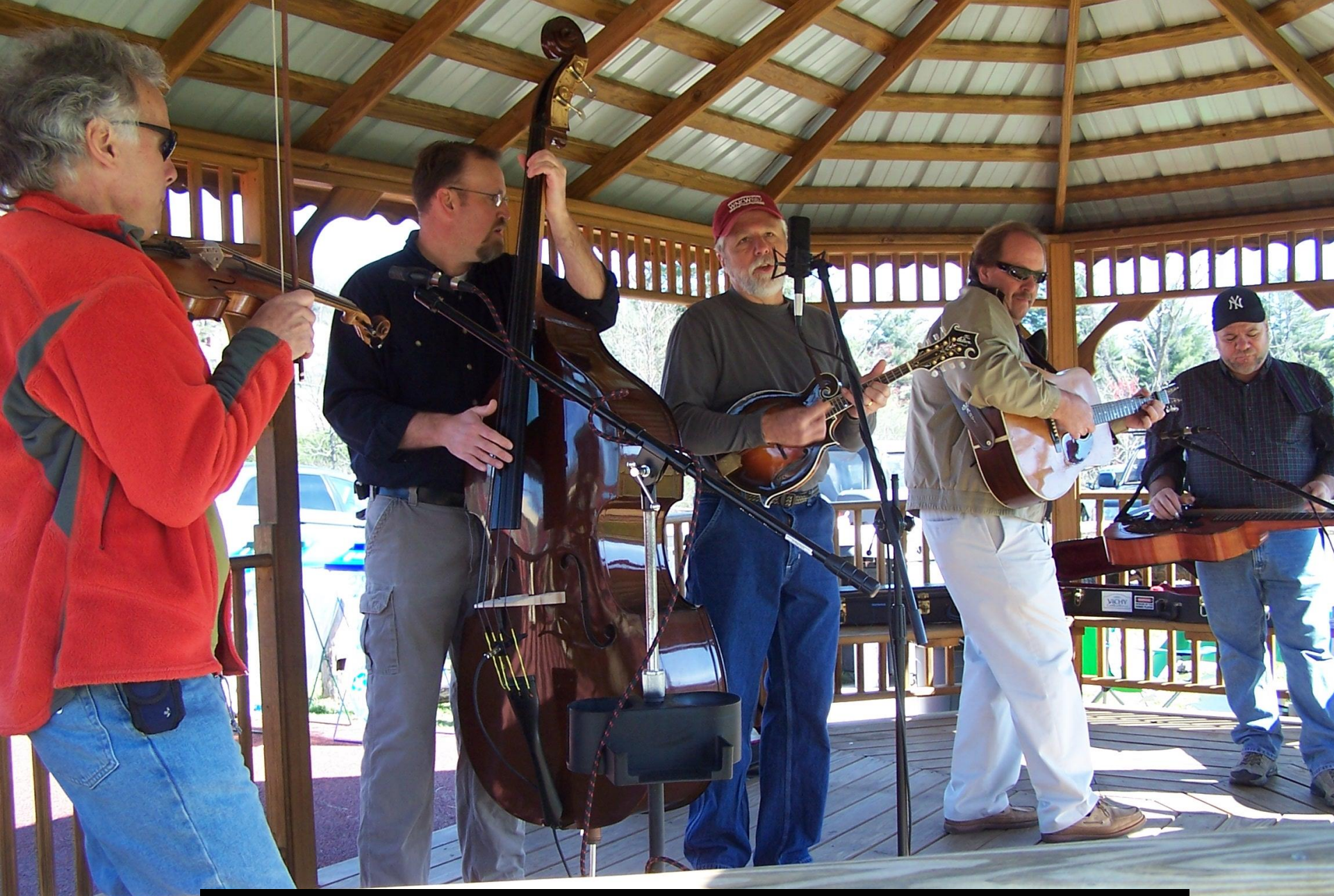
Local Entertainment – Frog Town Five Trail Days April 09