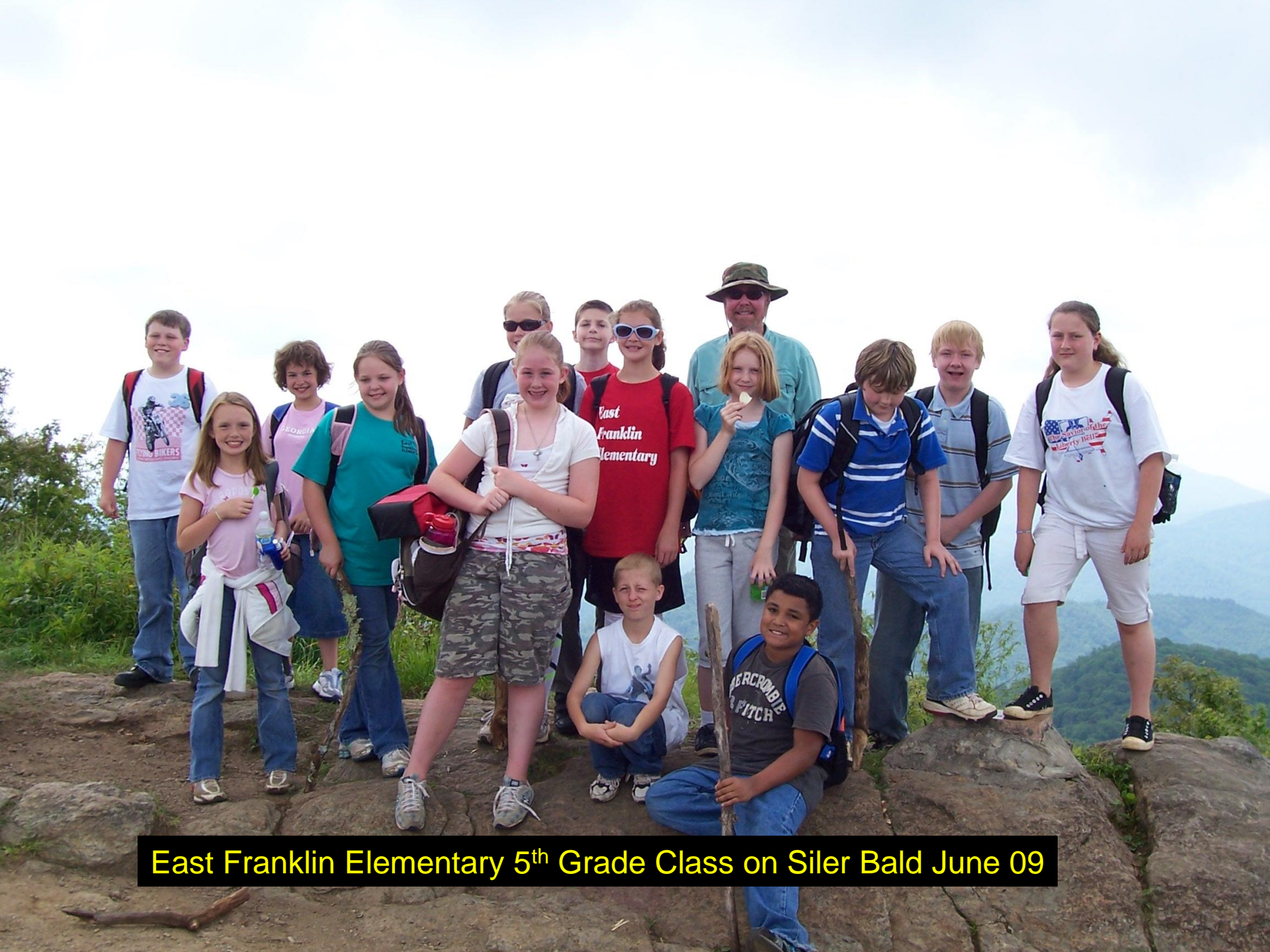
East Franklin Elementary 5 th Grade Class on Siler Bald June 09