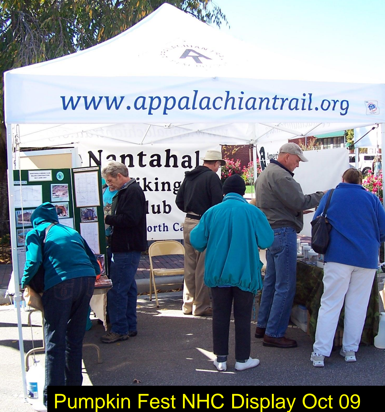
Pumpkin Fest NHC Display Oct 09