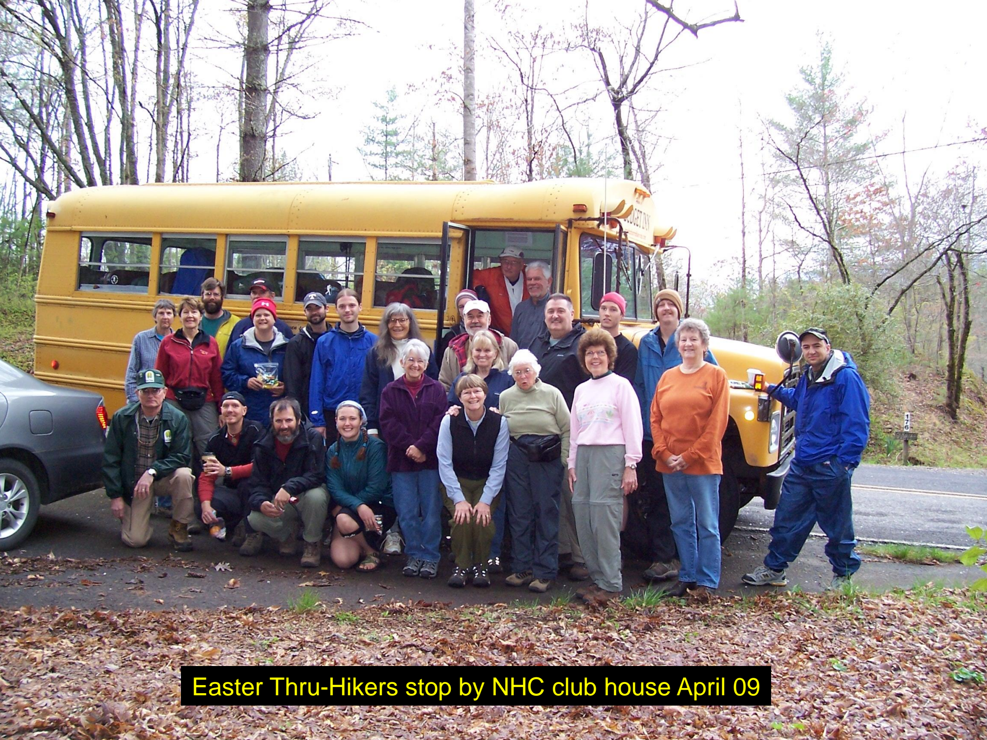
Easter Thru-Hikers stop by NHC club house April 09