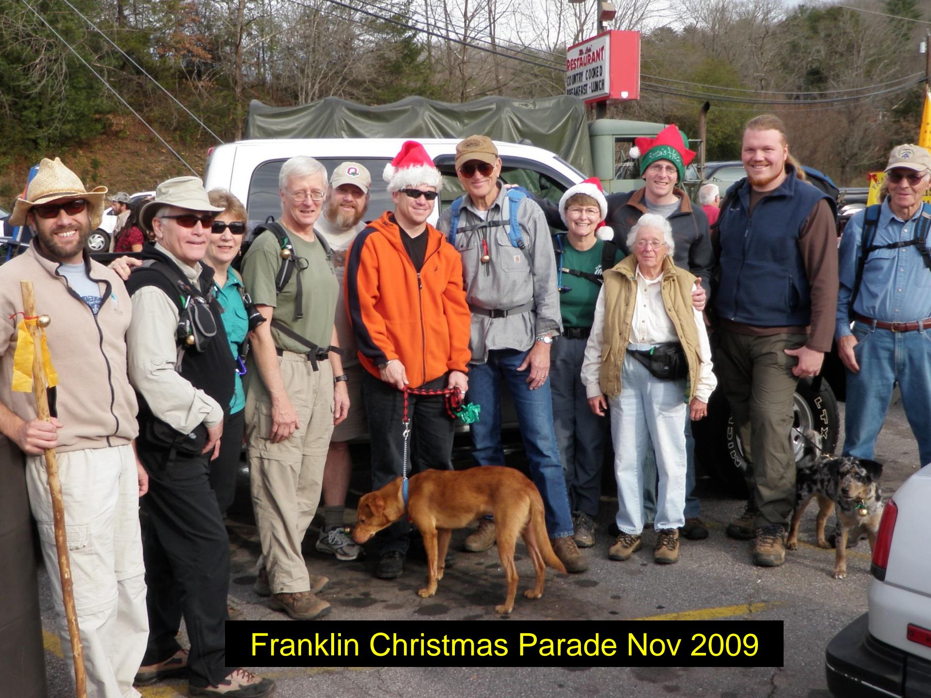
Franklin Christmas Parade Nov 2009