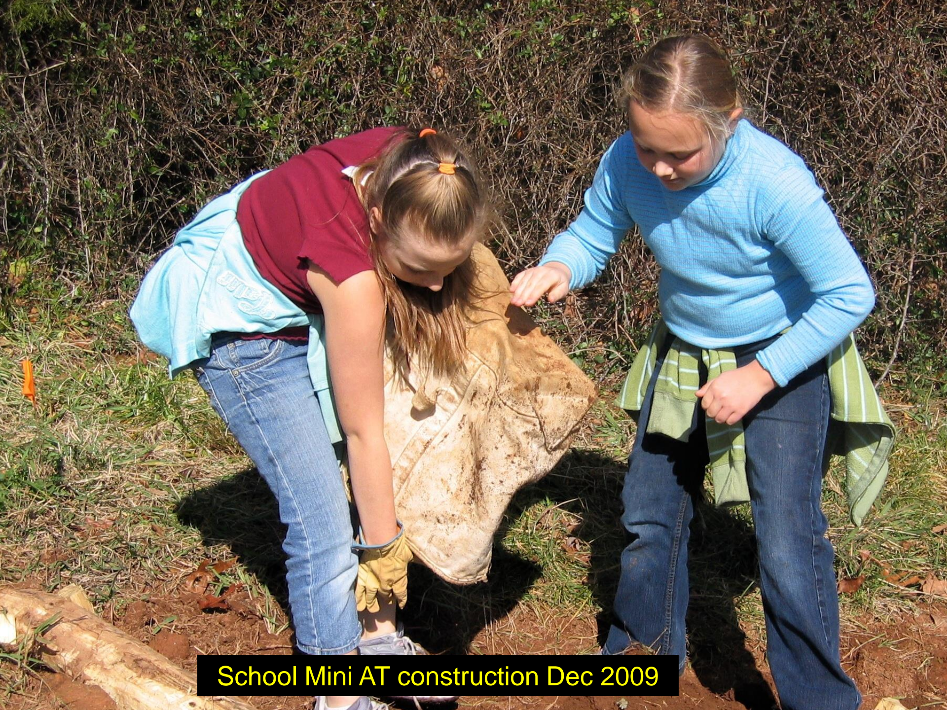
School Mini AT construction Dec 2009